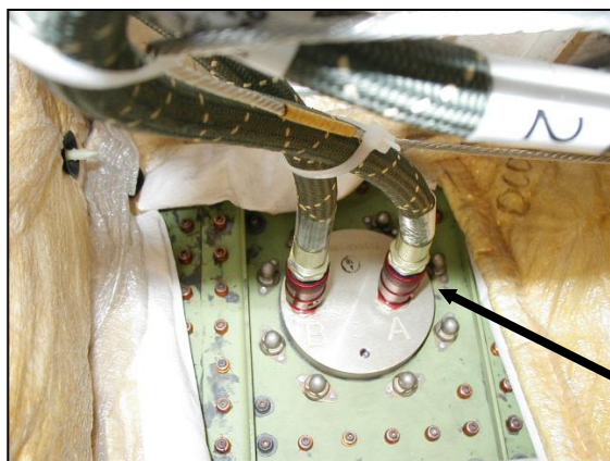
Air Sampler (View looking outboard)