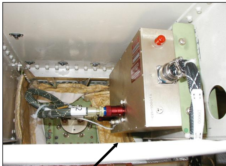
System Electronics Box (SEB) (View looking outboard)