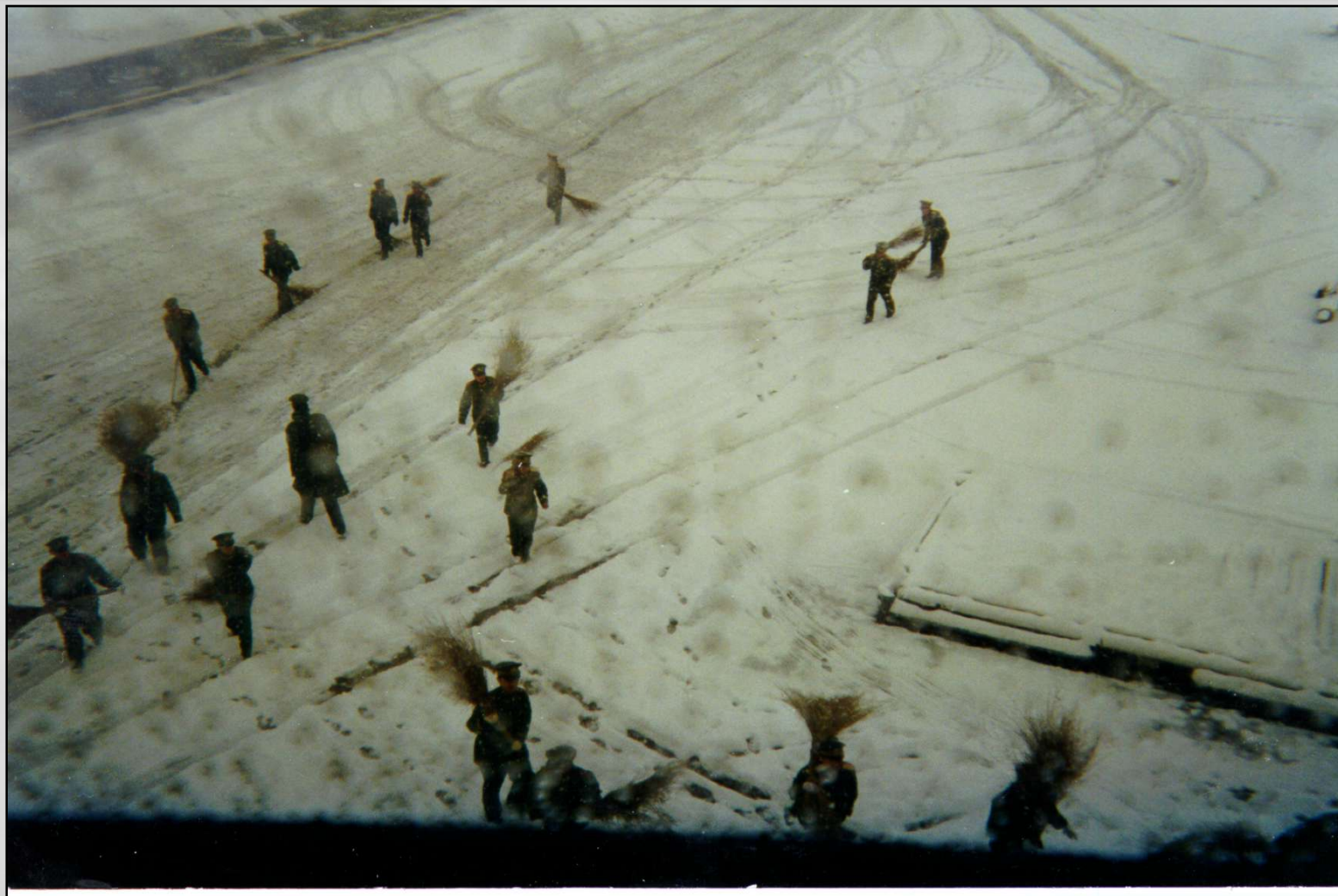
NBAA 61 st Annual Meeting and Convention 2008