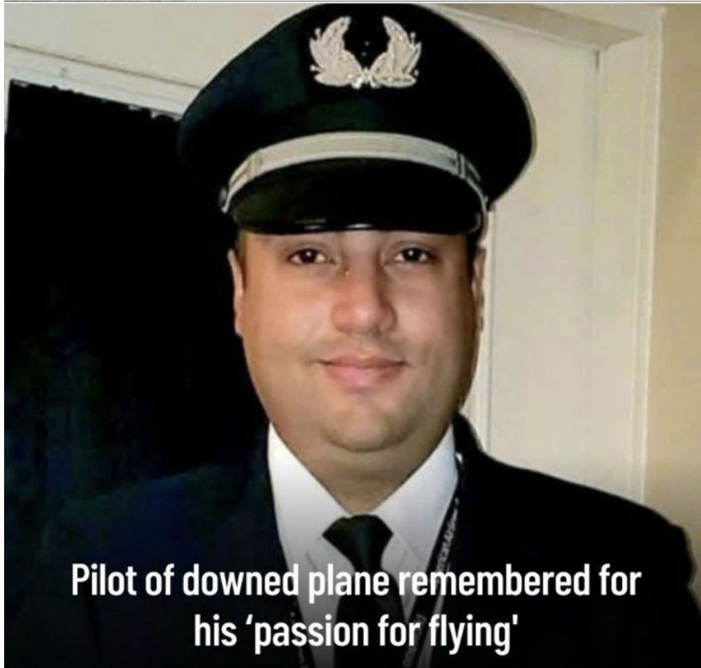
Pilot of downed plane remembered for his 'passion for flying'